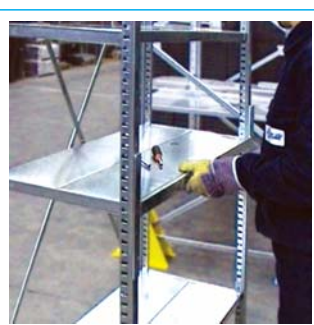
Corrente di irrigidimento